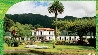
Furnas Boutique Hotel 4*