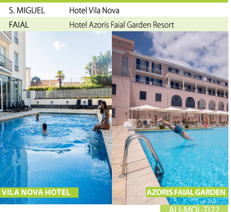
VILA NOVA HOTEL