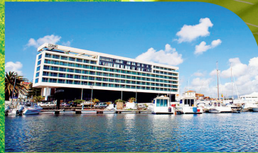
Azor Hotel 5*