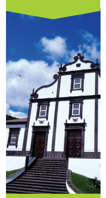
FULL DAY TOUR

Departure from Ponta Delgada towards the eastern part of the island. Stop at the viewpoint of Santa Iria for a view of the island's north coast. Continue along the north coast, stopping at the Ribeira dos Caldeirões where they can meet one of the still existing water mills on the island and the refreshing cascade of Ribeira dos Caldeirões. Continue along the north coast towards the village of Nordeste. Short stop in the village. Continue to Forest Park of Cinzeiro and visit the Environmental Interpretation Center of the Azorean Bulfinch. Picnic in the forest park. Return by the east coast with stops in Ponta da Madrugada viewpoint and the town of Povoação. Short stop at the crater lake of Furnas to stretch your legs and return to Ponta Delgada.