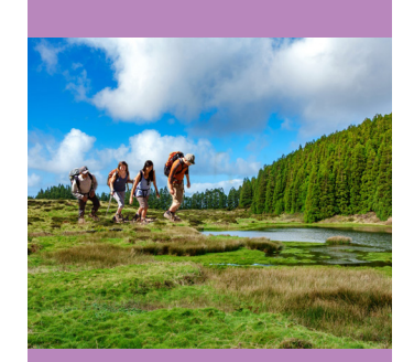
WALKING & HIKING