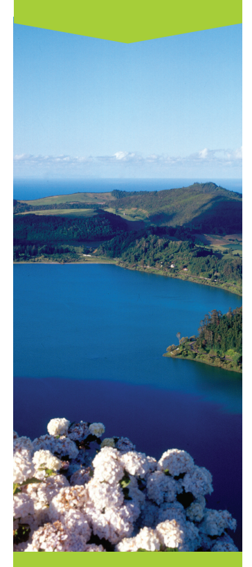
FULL DAY TOUR

Departure along the south road passing the village of Lagoa and the viewpoint of Caloura. Stop at Vila Franca (first capital of the island) for historical visit and coffee break. Arrival at the valley of Furnas, visit to the lake, hot springs and surrounding holes where meals are cooked by underground vapors. After lunch visit to the botanical garden (possibility to swim in a natural hot water swimming pool), and mineral water springs. Crossing to the north coast, stop at the tea plantation on the way, stop at Santa Iria viewpoint, return to Ponta Delgada.