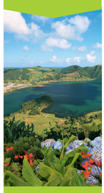
FULL DAY TOUR

Departure from Ponta Delgada to Fajã. de Baixo to visit the pineapple plantations, where the pineapples are grown in hot houses that create a perfect environment with the appropriate temperature for the plants to grow. The journey goes on to the viewpoint "Vista do Rei". Descend to the valley of Sete Cidades on the crater ground, passing by the green and blue lakes. Continue by the "Carvão" lake. Stop for lunch at a local restaurant. The trip follows to Ribeira Grande for a short stop at the town. Continue in direction of "Lagoa do Fogo". Before arriving to the top of the mountain, short stop at Caldeira Velha. Stop to admire the magnificent view of the "Lagoa do Fogo" (Fire Lake), the one lake in the island in which you encounter nature in a pure state and view of the island at an altitude of 900m. Return to Ponta Delgada.